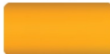
YELLOW (N 1080)