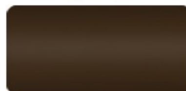
BROWN (N 8010)