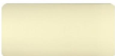
BEIGE (VSR 240)