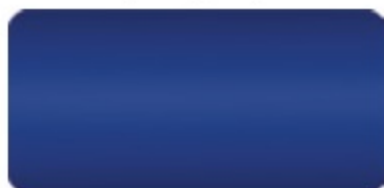
BLUE (RAL 5002)