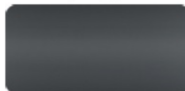
ANTHRACITE STRUCTURE (DB 703)