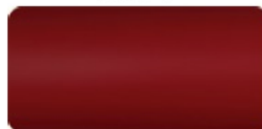
PURPLE RED (N 3560)