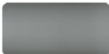
SILVER (GREY) (RAL 9007)