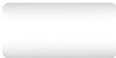
CREAM (N 0502-B)