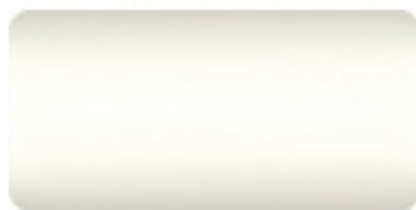
LIGHT IVORY (N 0502-Y)