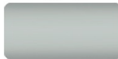
GREY (N 3000)