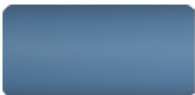
PIGEON BLUE (N 4030)