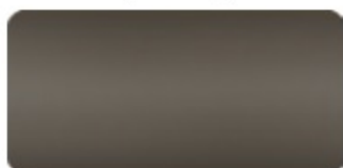
BEIGE GREY (VSR 780)