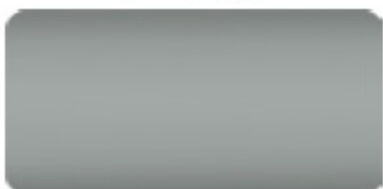
DUSTY GREY (RAL 7037)